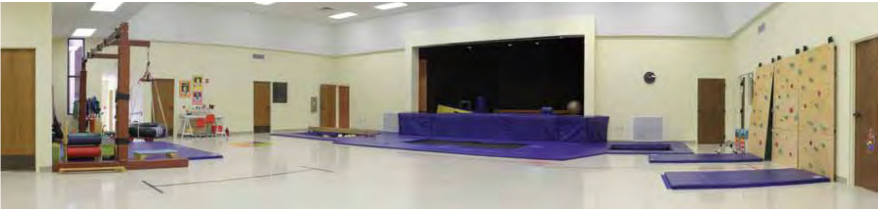
The 6,700-Square-Foot ACCESS Therapy Gym